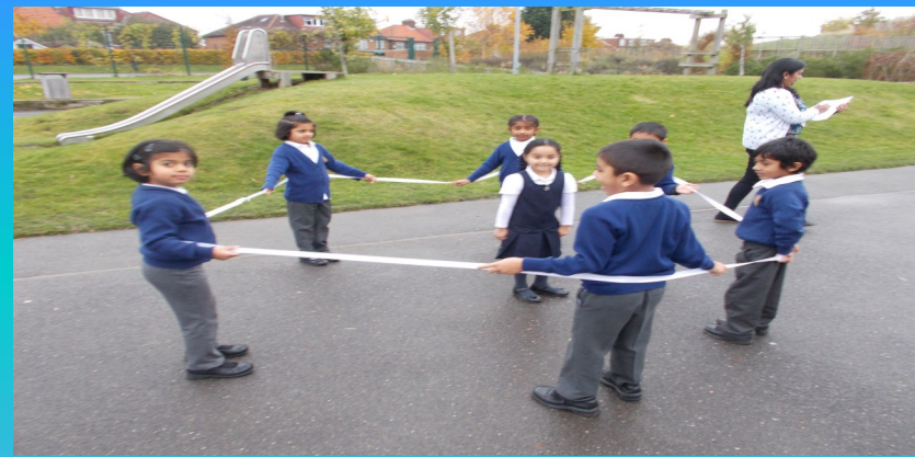
This is Year 1A making 2d shapes out of ribbons.