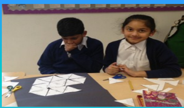
This is Year 5 doing a cross curricular activity on Roman numerals.