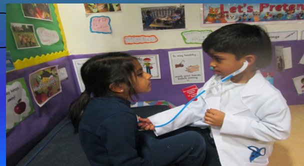
This is Reception B pretending to be like doctors.