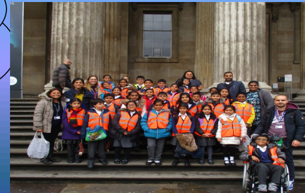
This is Year 4 on their school trip to the British Museum to learn about the Anglo Saxons and Vikings.