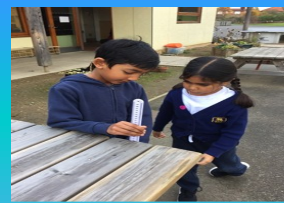
This is year 2B estimating measurement of different objects around the school using metre sticks.