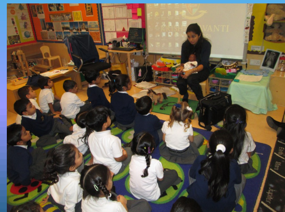
This is Reception A listening to a doctor that came to visit them.